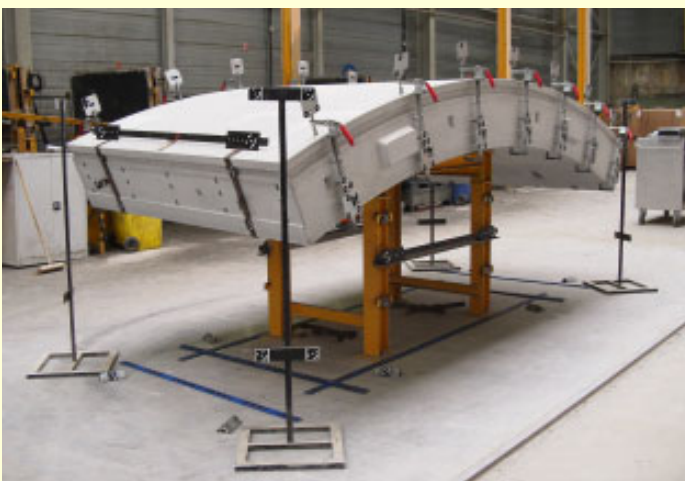
Signalized Concrete Segment

After the image data have been transferred to the evaluation PC, the calculation of the 3D coordinates is run largely automatically. Data analysis is done directly in the system or by external software packages.