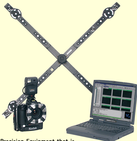
Precision Equipment that is robust and easy to handle