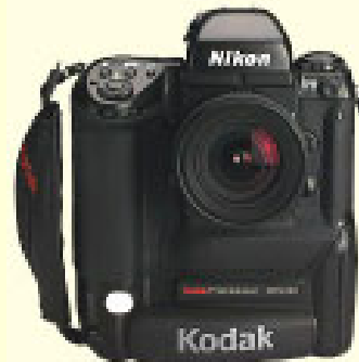
Camera Kodak DCS 660

Another important accessory is the ring flash. Bright focal lighting from the direction of the recording axis guarantees that the retro-reflective targets stand out clearly from the background. With suitable lighting and exposure the background vanishes almost completely and the image only shows the reflecting target as the base for calculation.