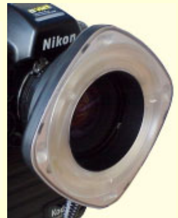
Camera with ring flash