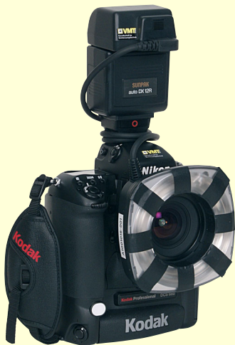
High Resolution Digital Camera (3000 x 2000 Pixel)